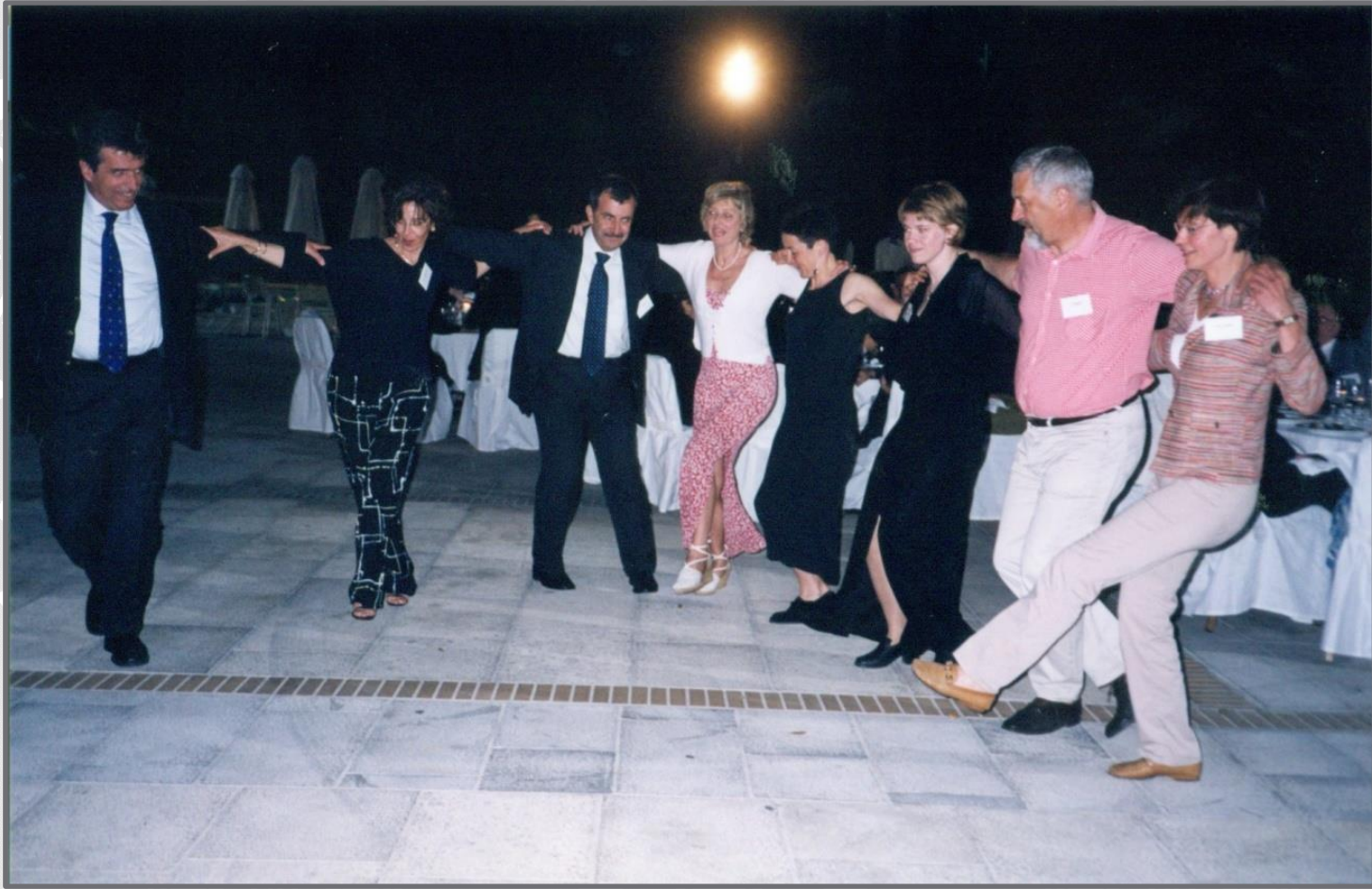
Annual Conference 2003, Athens, Greece