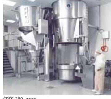
GPCG 300, open