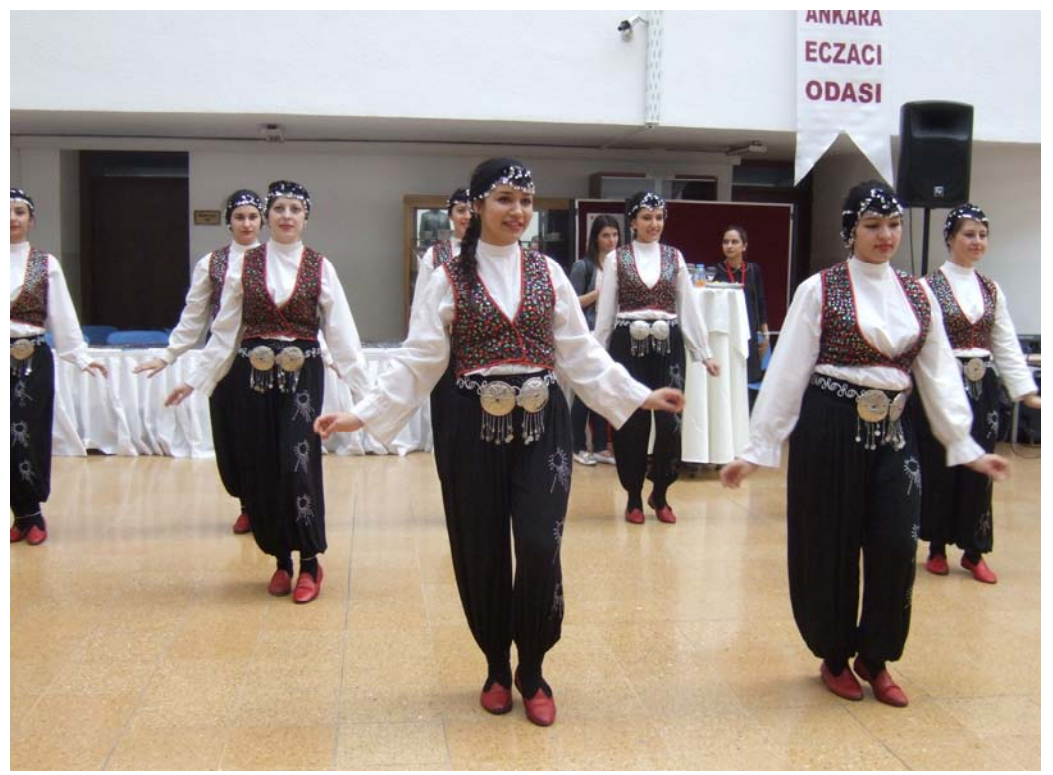
Faculty of Pharmacy, University of Ankara students during the Welcome reception