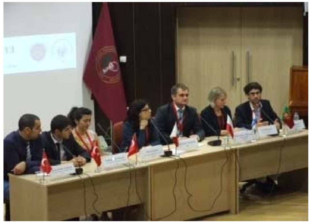
The panel during the International Student Session