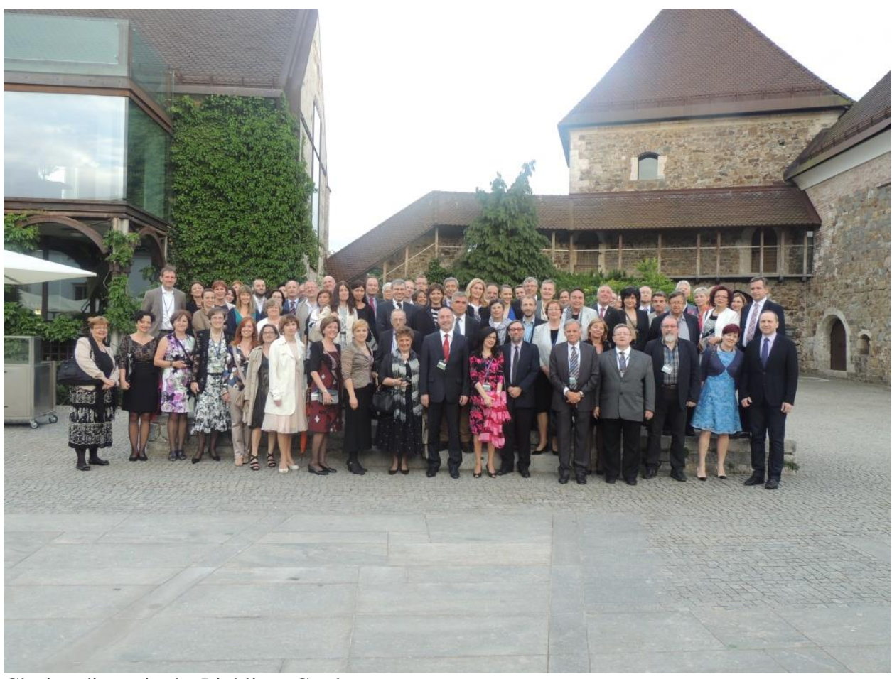
Closing dinner in the Ljubljana Castle