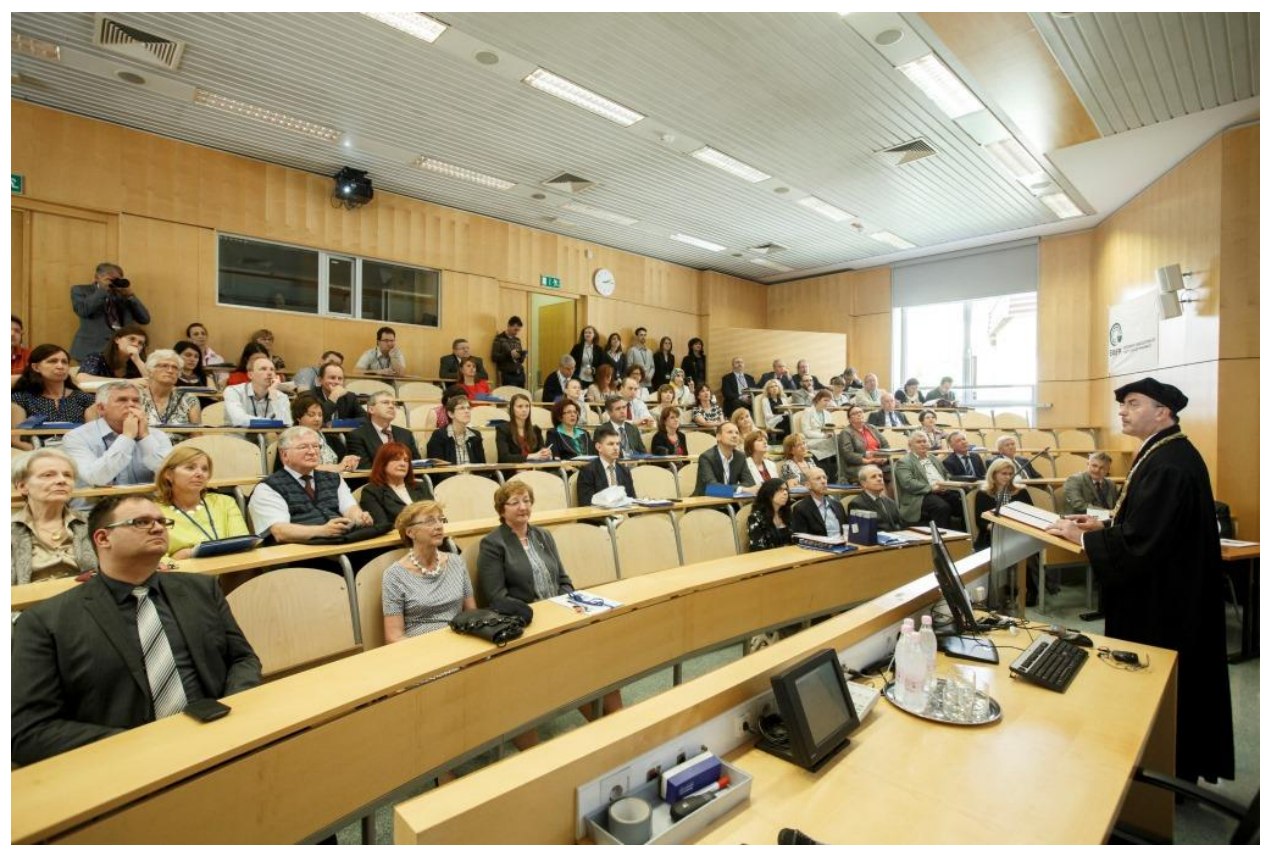
Ljubljana EAFP Annual Conference opening ceremony