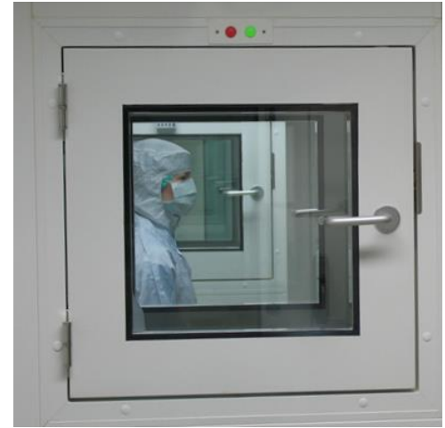
Photo from Savo Vocational College's Clean room, Kuopio