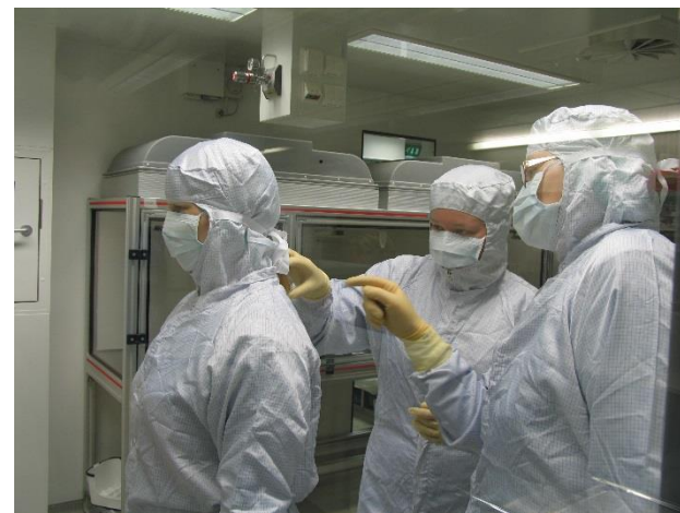
Photos from Savo Vocational College's Clean room, Kuopio