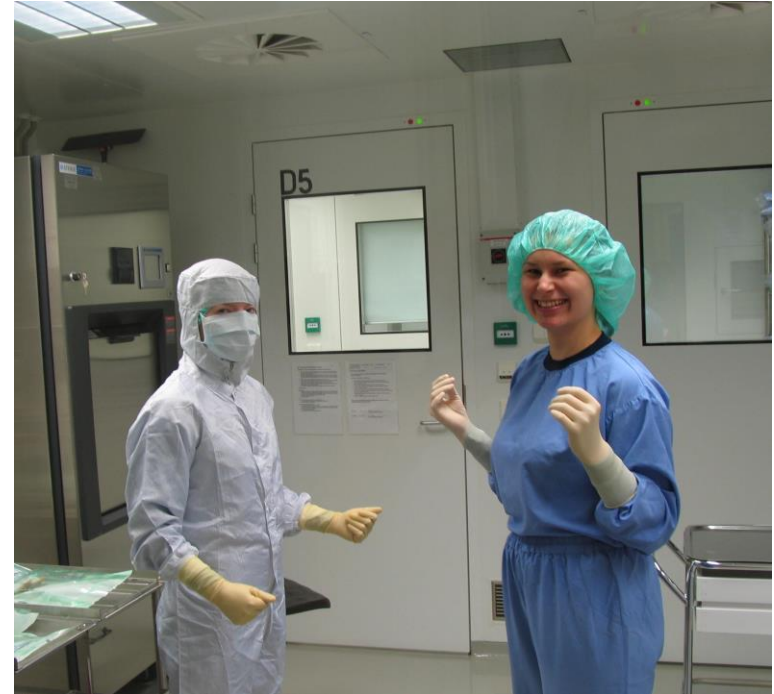
Photo from Savo Vocational College's Clean room, Kuopio