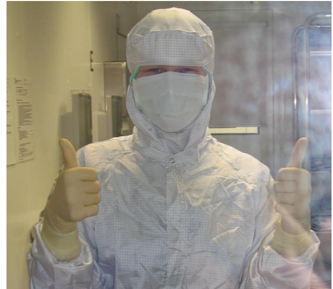
Photo from Savo Vocational College's Clean room, Kuopio